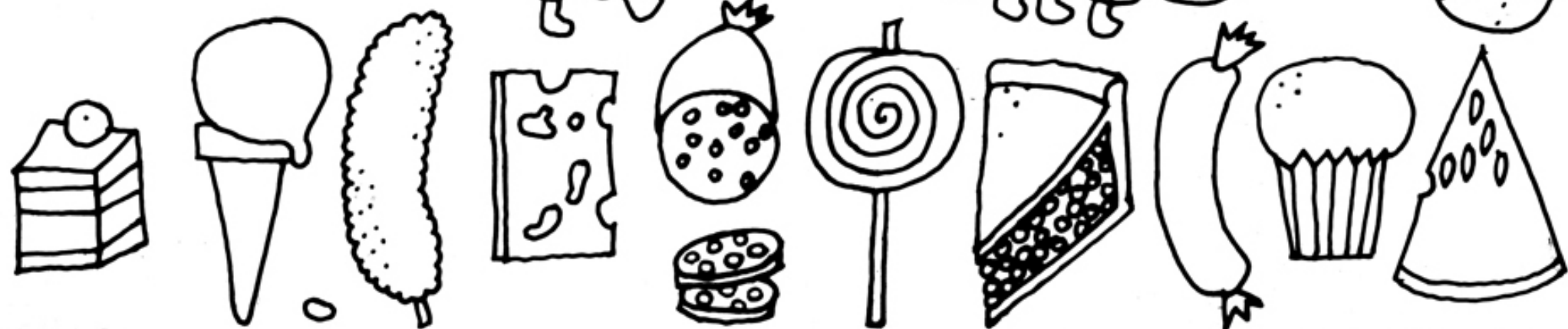
Illustration © 1969 & 1987 by Eric Carle